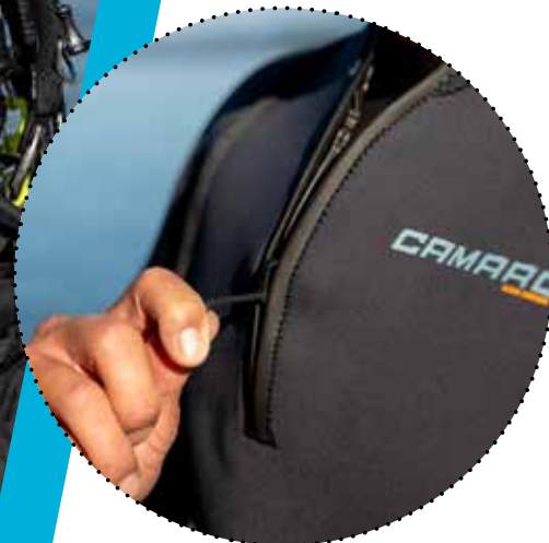
Front relief zip Noticeable relief immediately after diving