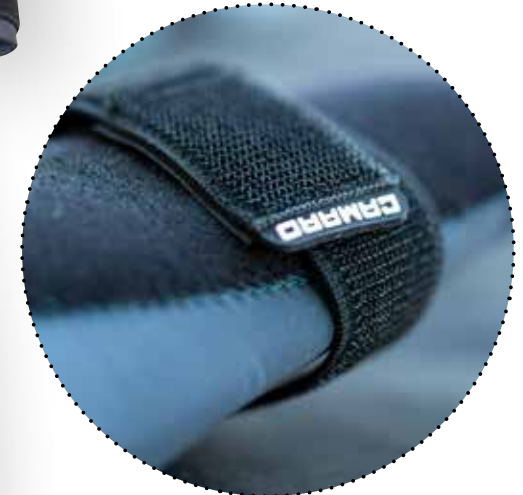
Wrap-around velcro fasteners on arms and legs minimize water entry