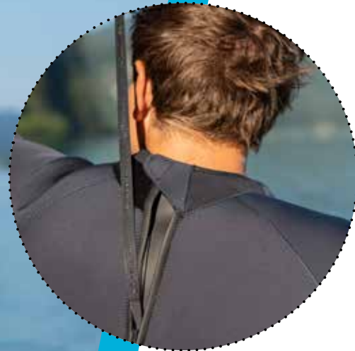
G-Lock back zip minimizes water entry