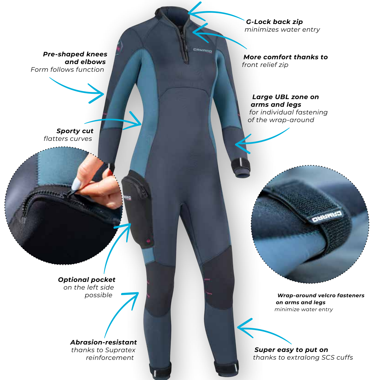
G-Lock back zip minimizes water entry

Semi Dry Diving at its finest! The new Icon is designed to meet the highest demands. Maximum freedom of movement meets first-class thermal insulation. The new cut offers an ideal fit and top comfort – all in iconic style!