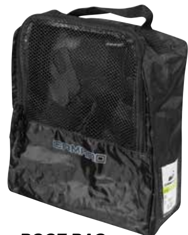
BOOT BAG inclusive